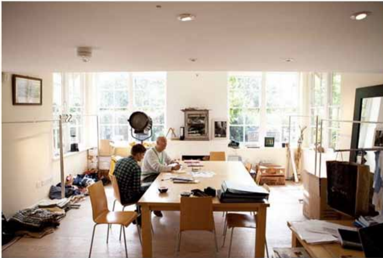
I'm in awe/envy on his studio space. One day...

There are some great shots on there that I thought I'd show here but get over to their site for the full run down. I'm looking forward to the next issue of Journal de Nimes even more now!